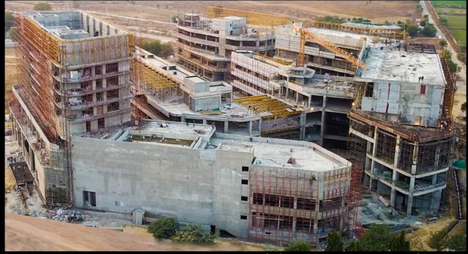
Actual Site Images As On November 2020