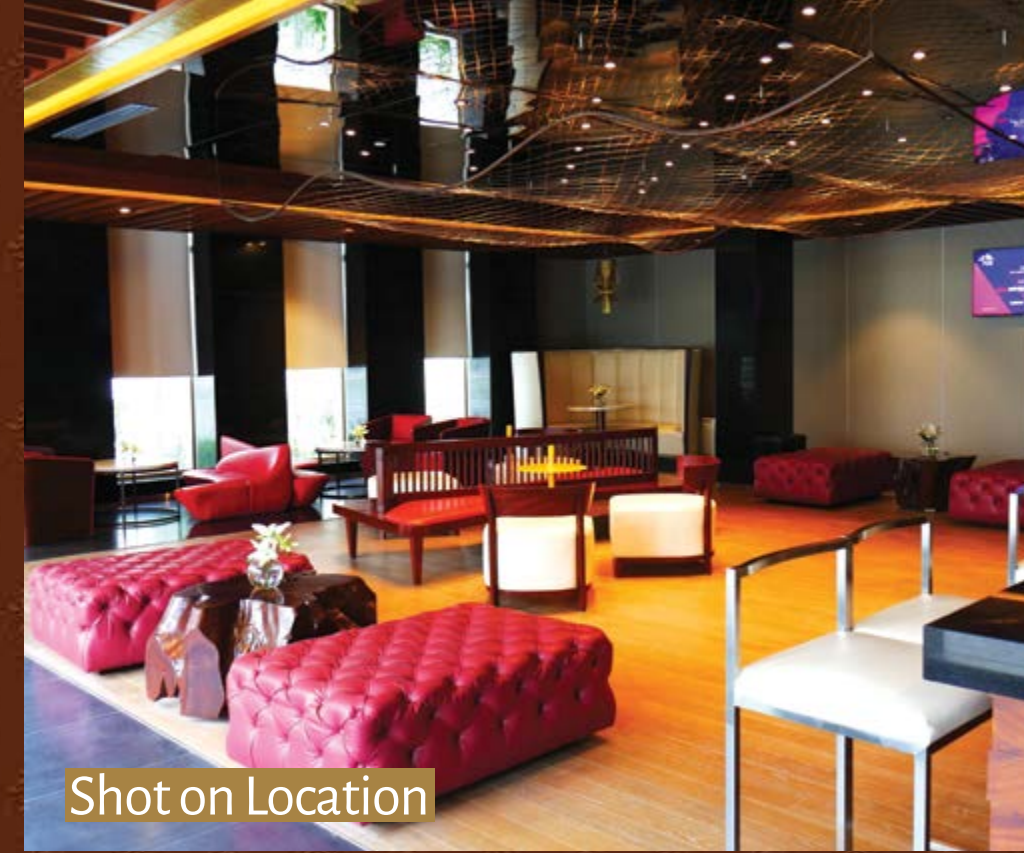
Shot on Location

M3M Golfstate, of which the distinguished M3M Polo Suites is a part of, is an ode to luxury. It is a coveted address where design finesse is wrapped in an air of sophistication. Set over an expansive 56+ acres, it offers over 101 reasons to live and celebrate life of the highest order.