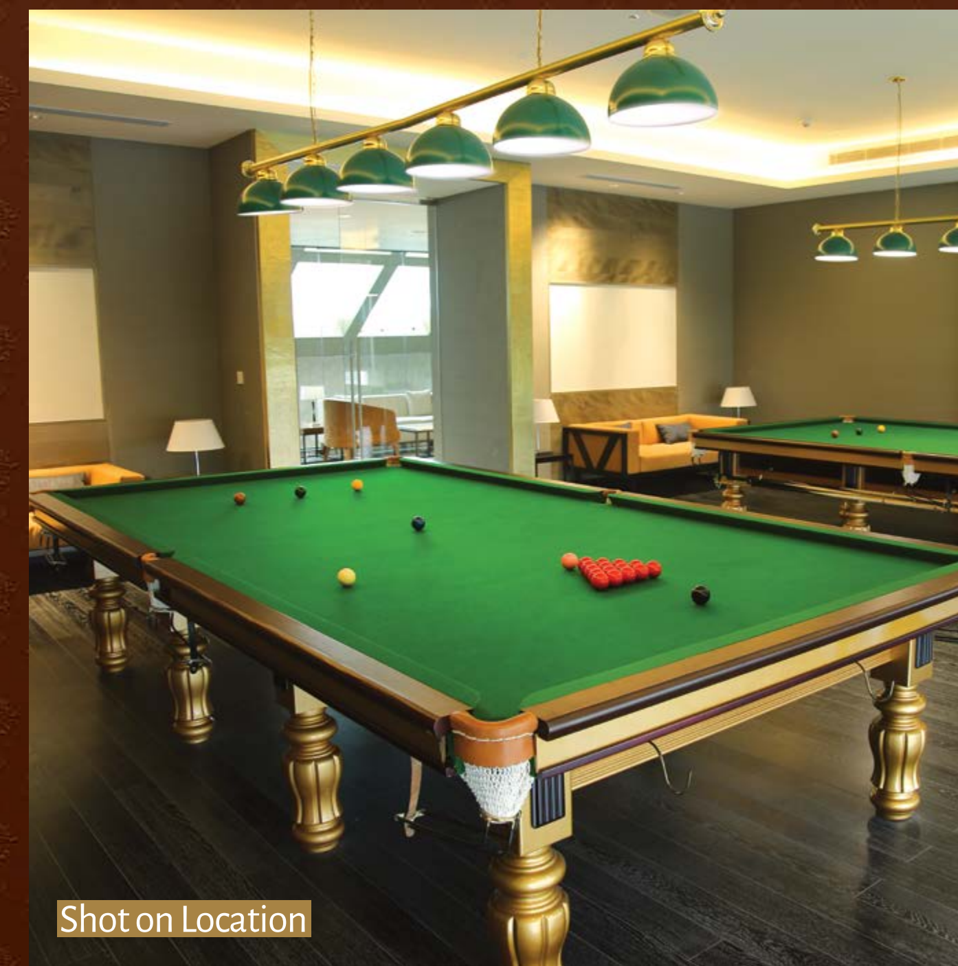
Shot on Location