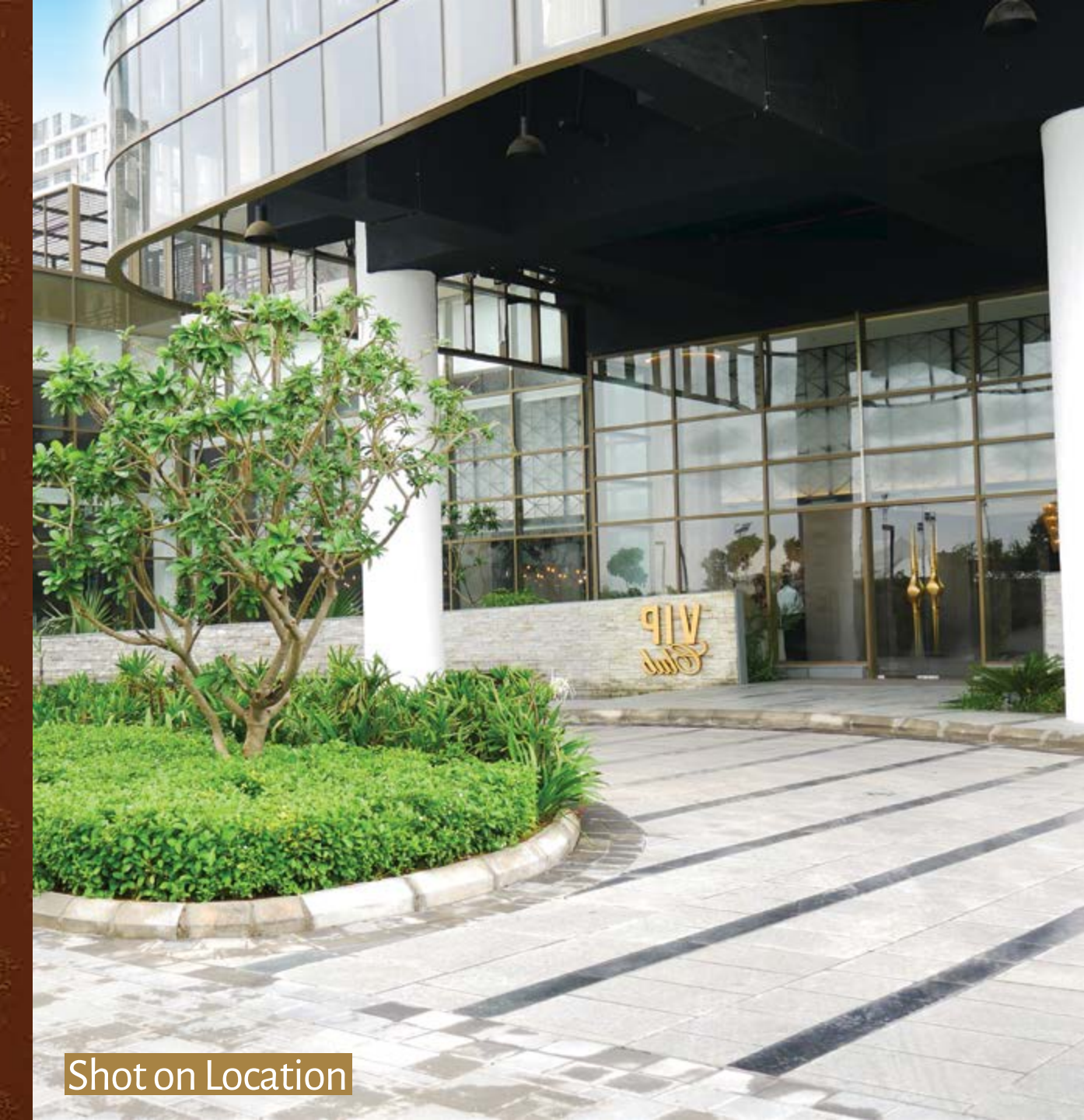
Shot on Location