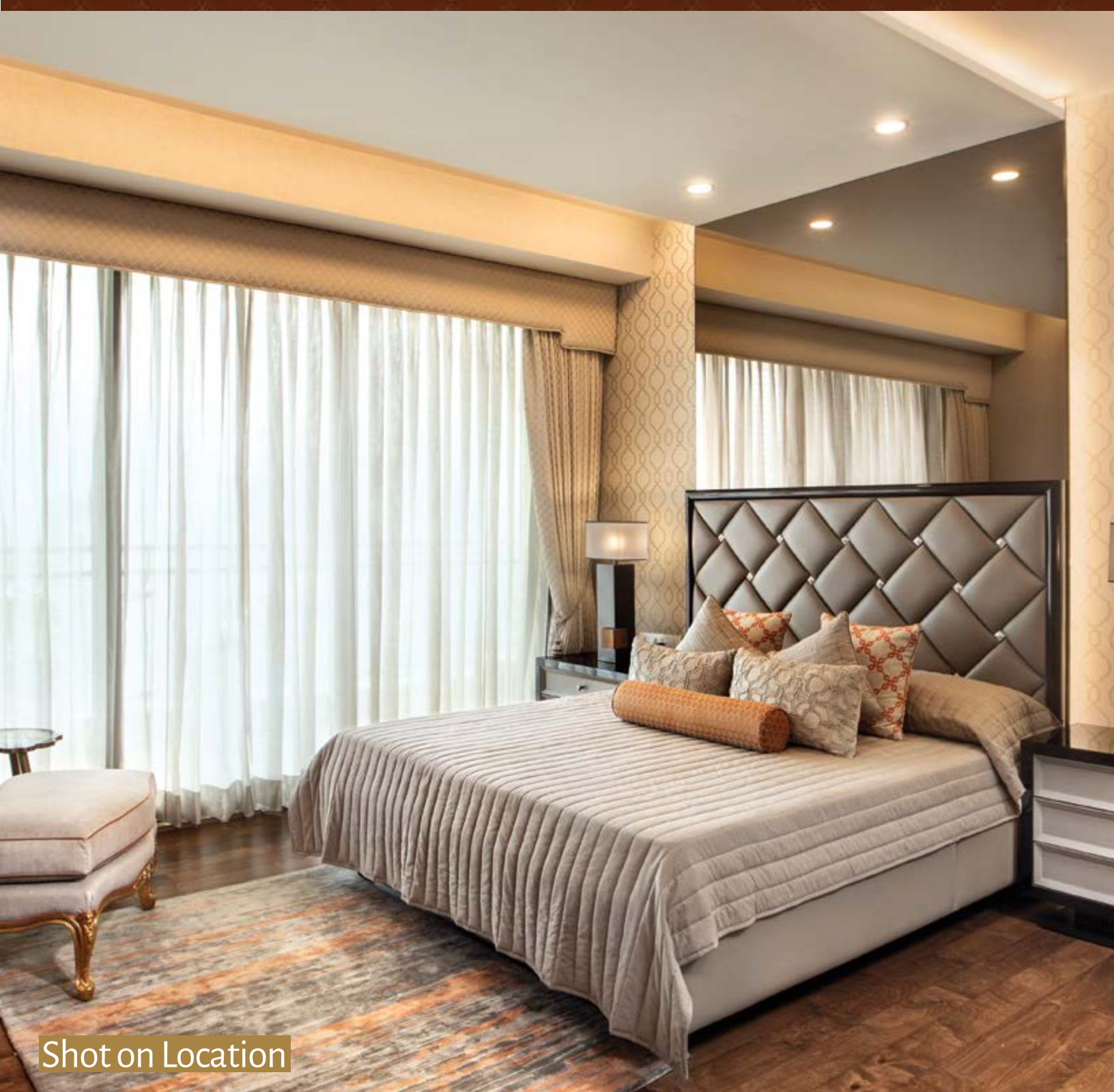
Shot on Location