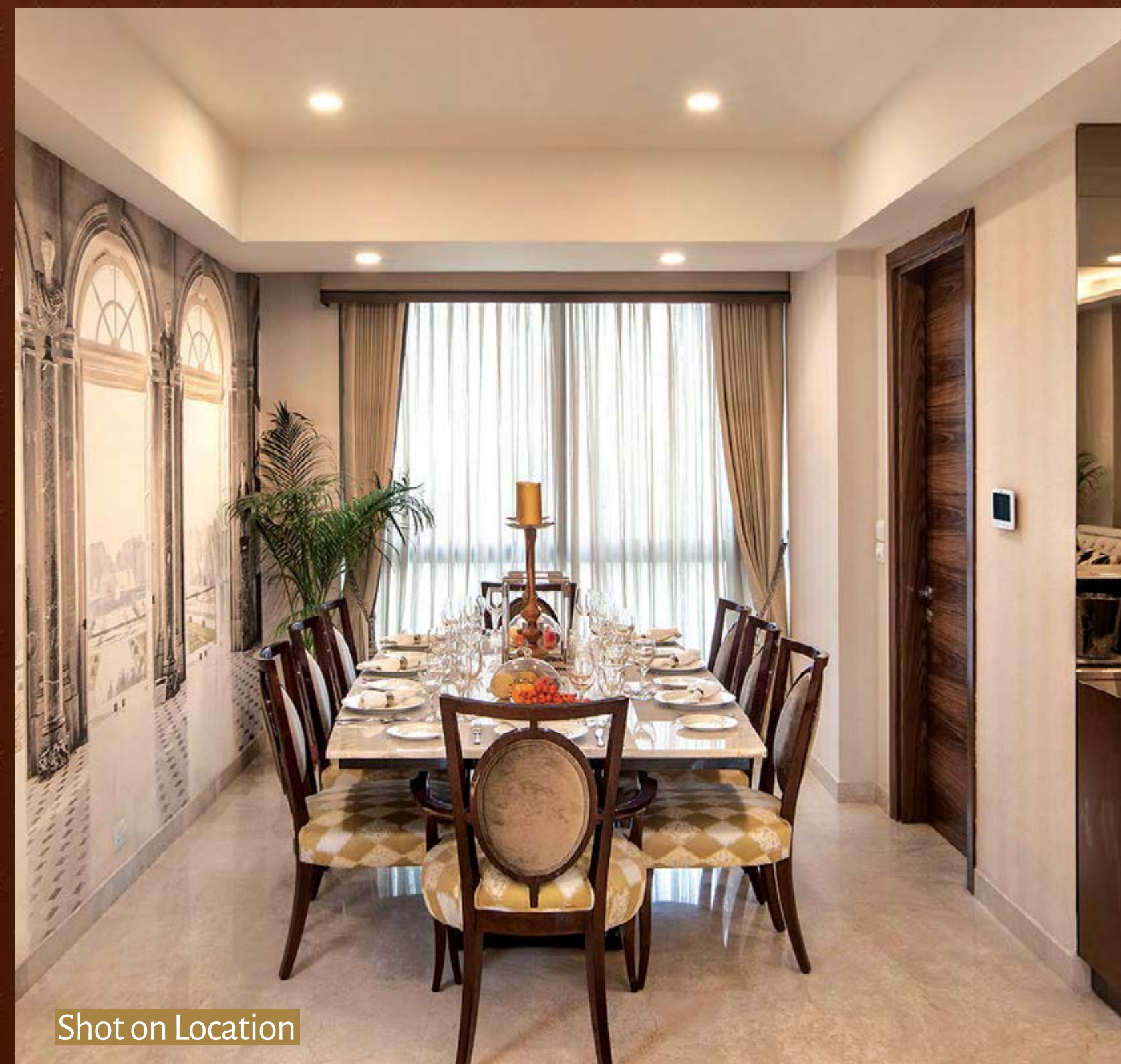
Shot on Location