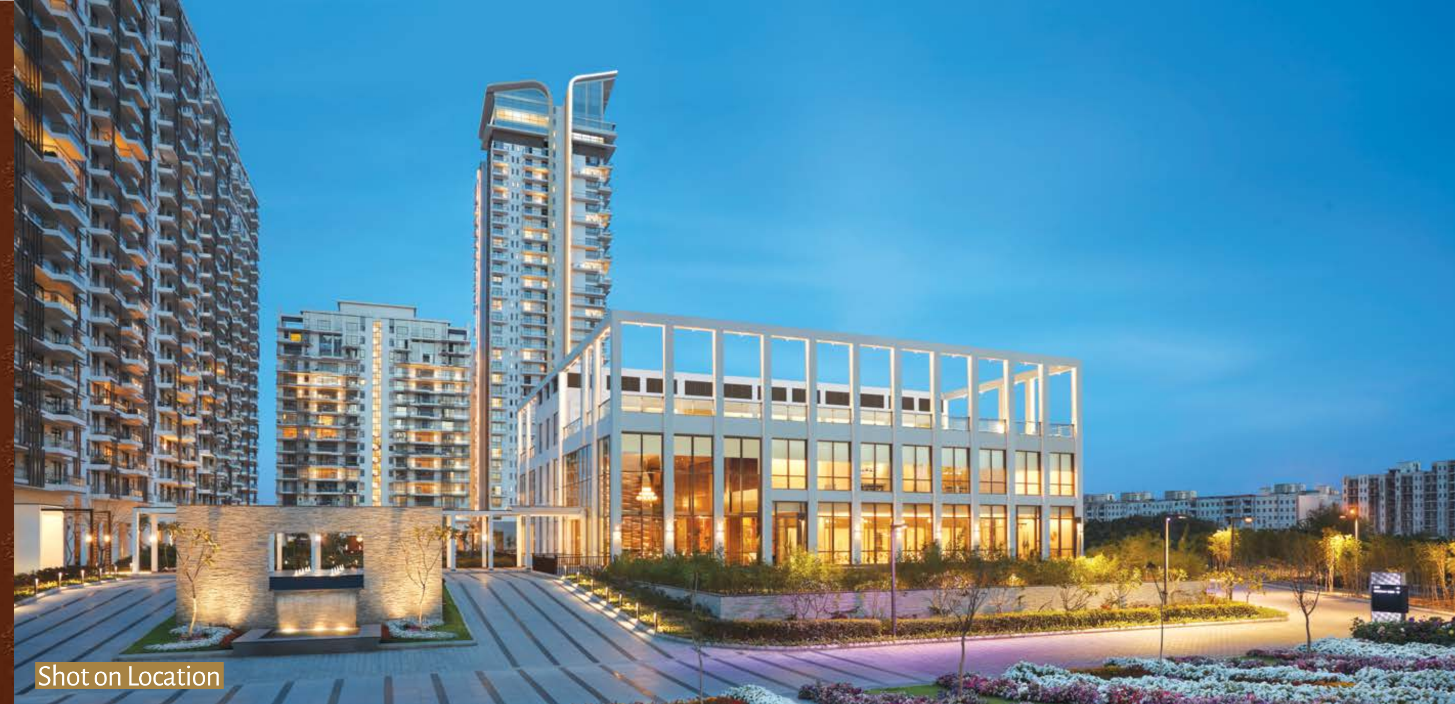
Shot on Location