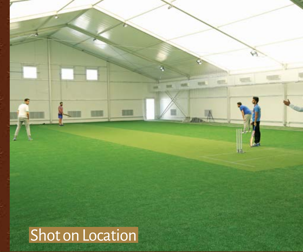
Shot on Location