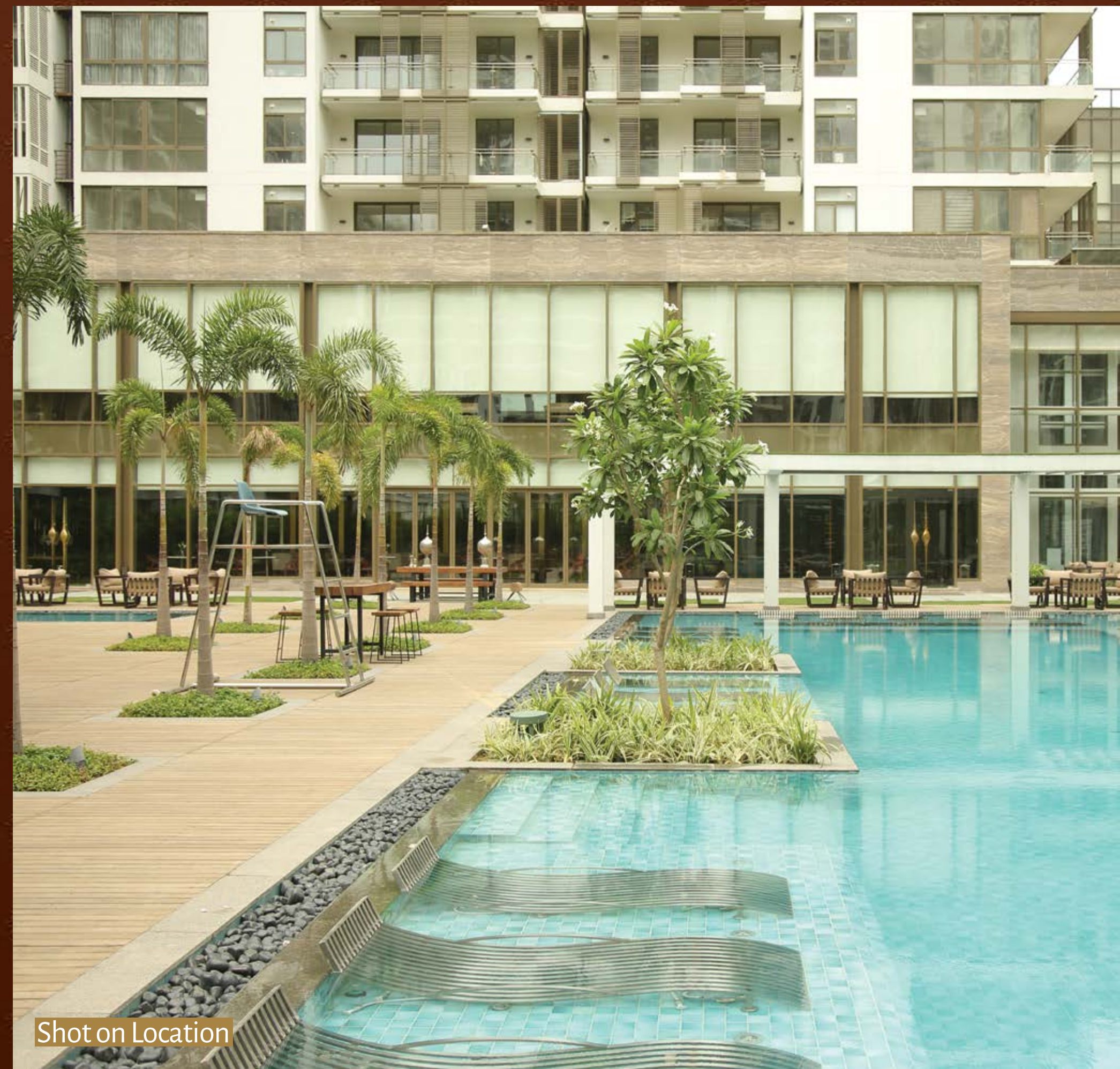
Shot on Location