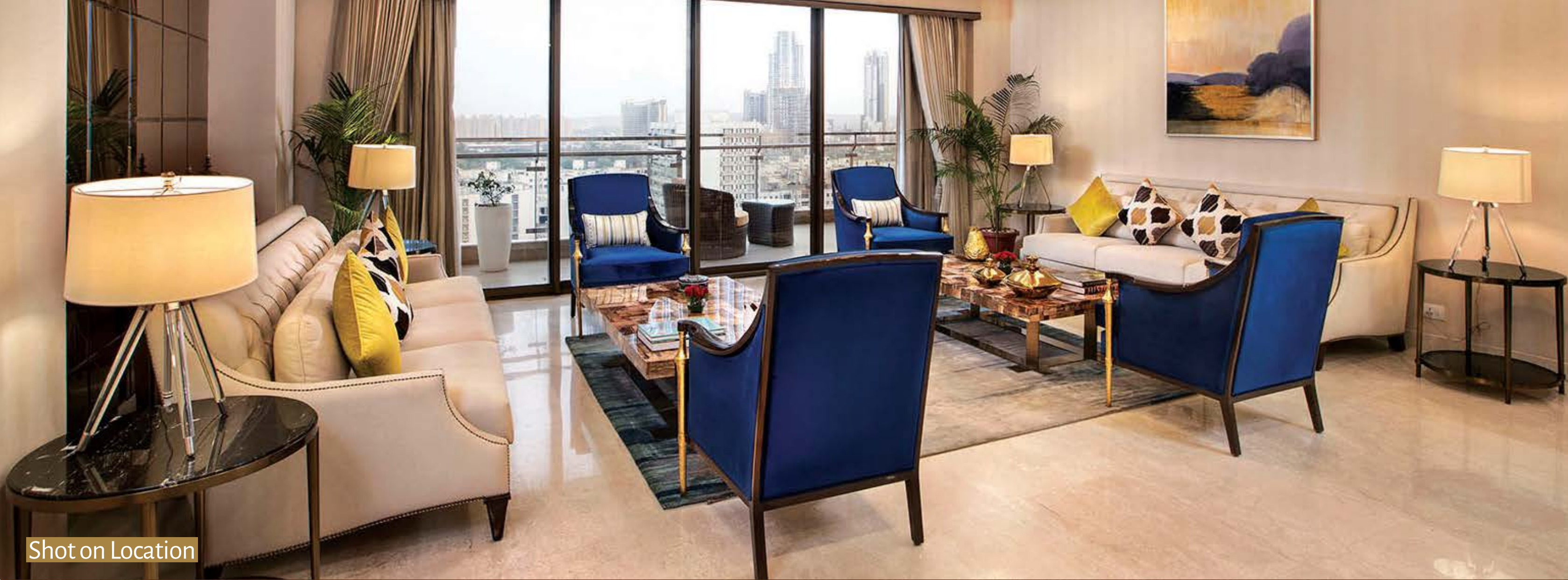
Shot on Location