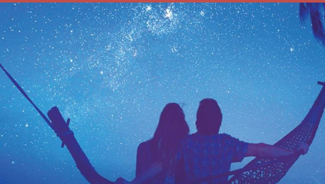
STAR GAZING DECK