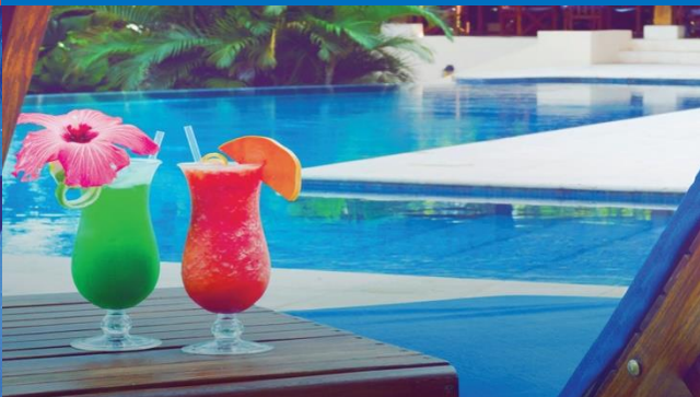
POOL JUICE BAR