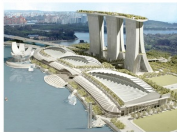
MARINA SANDS, SINGAPORE