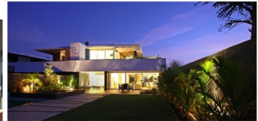
INFINITI BAY LUXURY SPA RESIDENCES, GOA