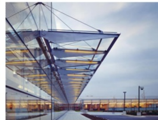
US CENSUS BUREAU, MARYLAND, USA

In keeping with Conscient's commitment to the highest standards of quality, we have engaged Aedas as our architects for Heritage One. Aedas is one of the leading architectural design practices in the world. Employing over 2000 personnel across 38 offices worldwide, it is the largest privately owned practice in the world. Aedas has created some of the best and most extensively awarded architectural design solutions across the world.