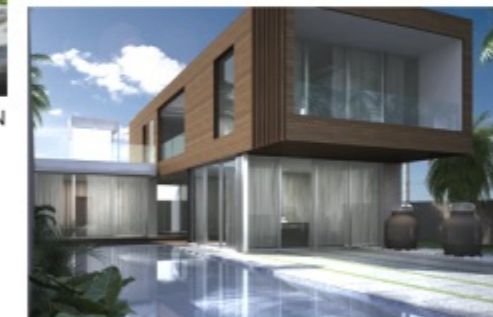
CALEM GROVE LUXURY HOMES, GOA