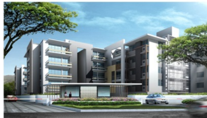
ARBOREA LUXURY HOMES, DEHRADUN