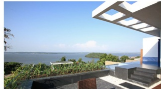
INFINITI BAY LUXURY SPA RESIDENCES, GOA

Conscient Infrastructure Pvt. Ltd., formerly known as BCC, is a real estate design and development organization that has constructed and delivered more than 10 million sq.ft. of projects over the past three decades. As a result, we are not only renowned for our professional and planned approach in implementing projects, but have also earned the trust of over 10,000 satisfied clients.