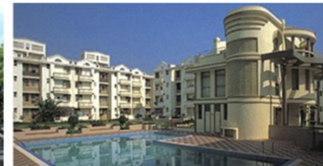
HARMONY HOMES, GURGAON